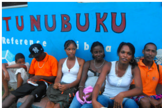
Ungdomar utanför biblioteket i Salybia.