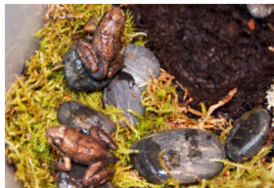
Färdiga små grodor! Nu gäller det att äta och bli stor.

Vi fick jättemycket uppmärksamhet från världens alla håll när nyheten om våra kycklinggrodor och deras bon och ungar släpptes. Vi har precis flyttat ut ungar från två av våra tre bon till egna lådor. Hitintills har vi 64 ungar! När de flyttas från sin mamma har de fortfarande lite av sin svans kvar. Inom några dagar absorberas svansen och ungarna ser ut som små minigrodor. Och de har en glupande aptit. Små sursor, bananflugor, ja allt de får in i sin lilla mun äter de. Det är viktigt att de äter och blir stora och starka nu. Om ett år ska dessa små viktiga och värdefulla djur, flygas till Montserrat och släppas ut i naturen igen. Det är till dessa små sötnosar vi sätter vårt hopp. Följ länken för att läsa en tidning som tog upp nyheten: http://www.wildlifeextra.com/go/news/mountain-chicken-tadpole009.html#cr